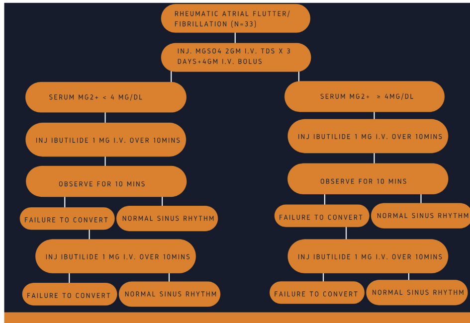
Fig. 1. Administration of Ibutilide and magnesium.

associative factors. Presence of background beta blocker therapy, high serum potassium at time of Ibutilide injection and high serum magnesium at time of Ibutilide injection were found to have